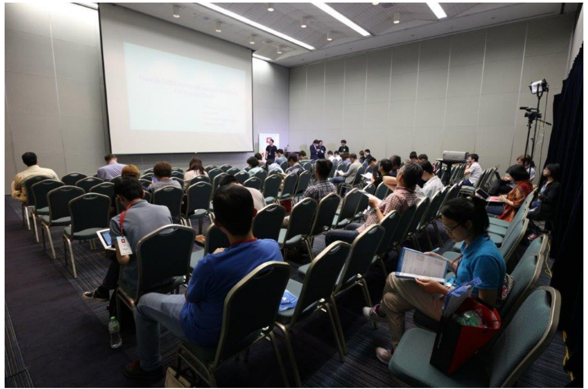
OpenStack International Technology Application Seminar Course 101D