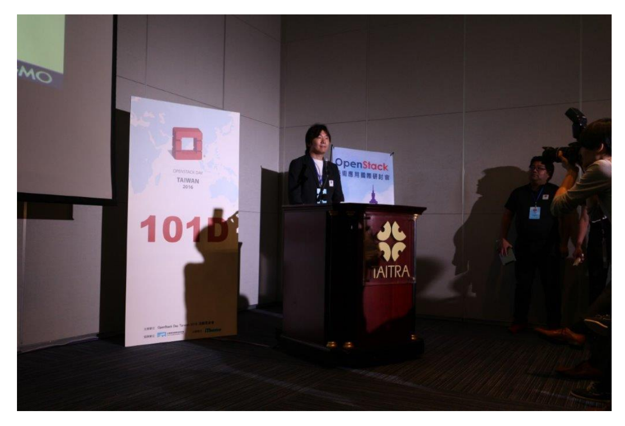
OpenStack International Technology Application Seminar Course 101D