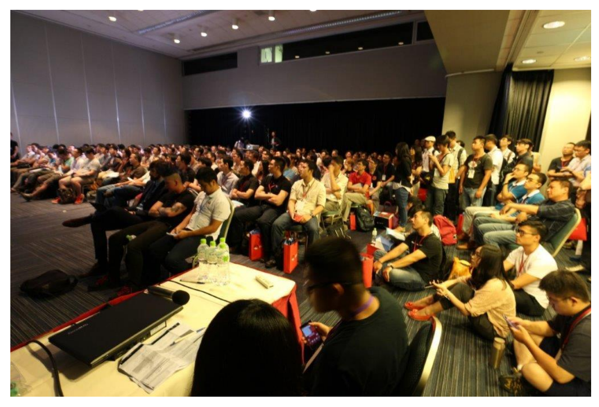
OpenStack T International Technology Application Seminar Course 101D