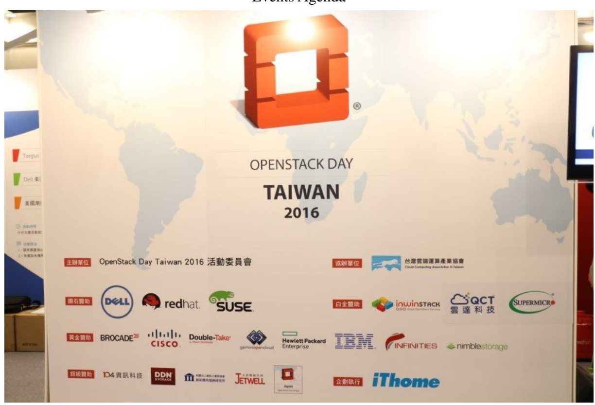
Event Sponsor display wall