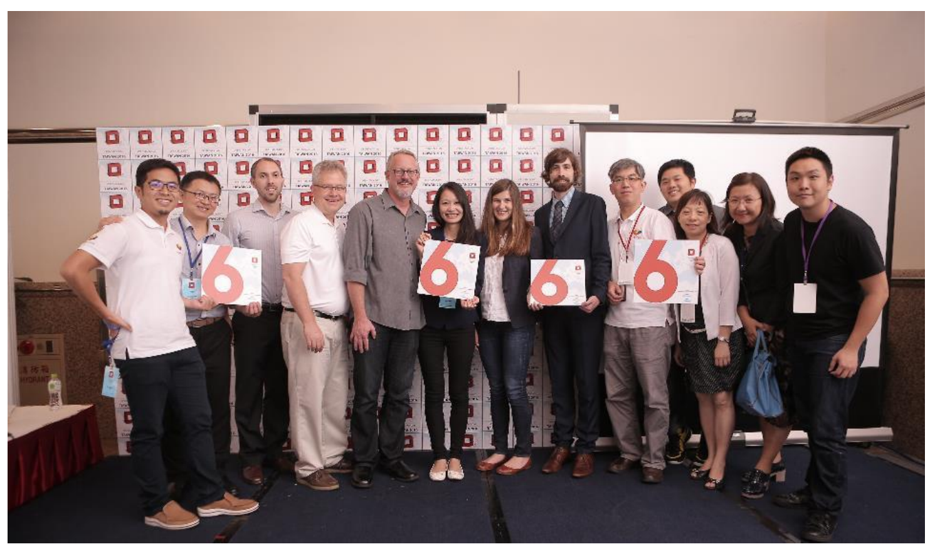
Happy 6<sup>th</sup> birthday celebration for the OpenStack Foundation