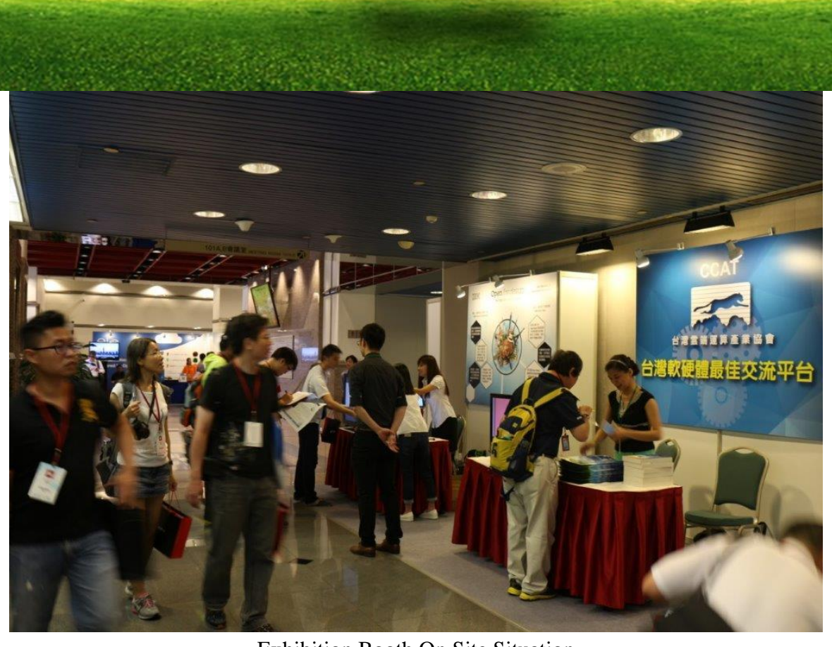
Exhibition Booth On Site Situation