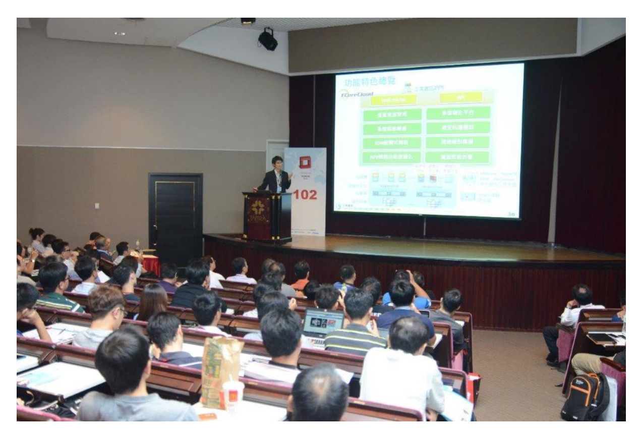
OpenStack International Technology Application Seminar Course 102