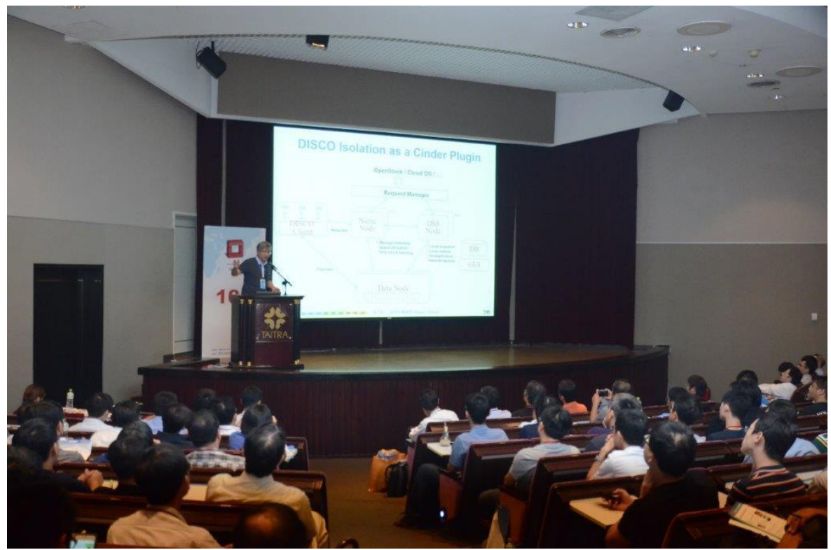
OpenStack T International Technology Application Seminar Course 102