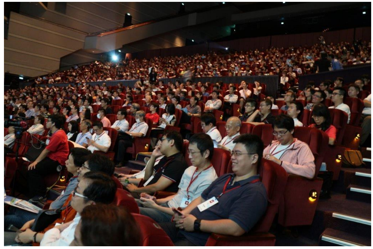
Opening Keynote Speech Venue