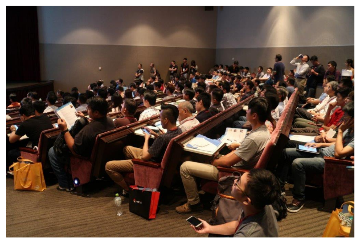
OpenStack International Technology Application Seminar Course 102