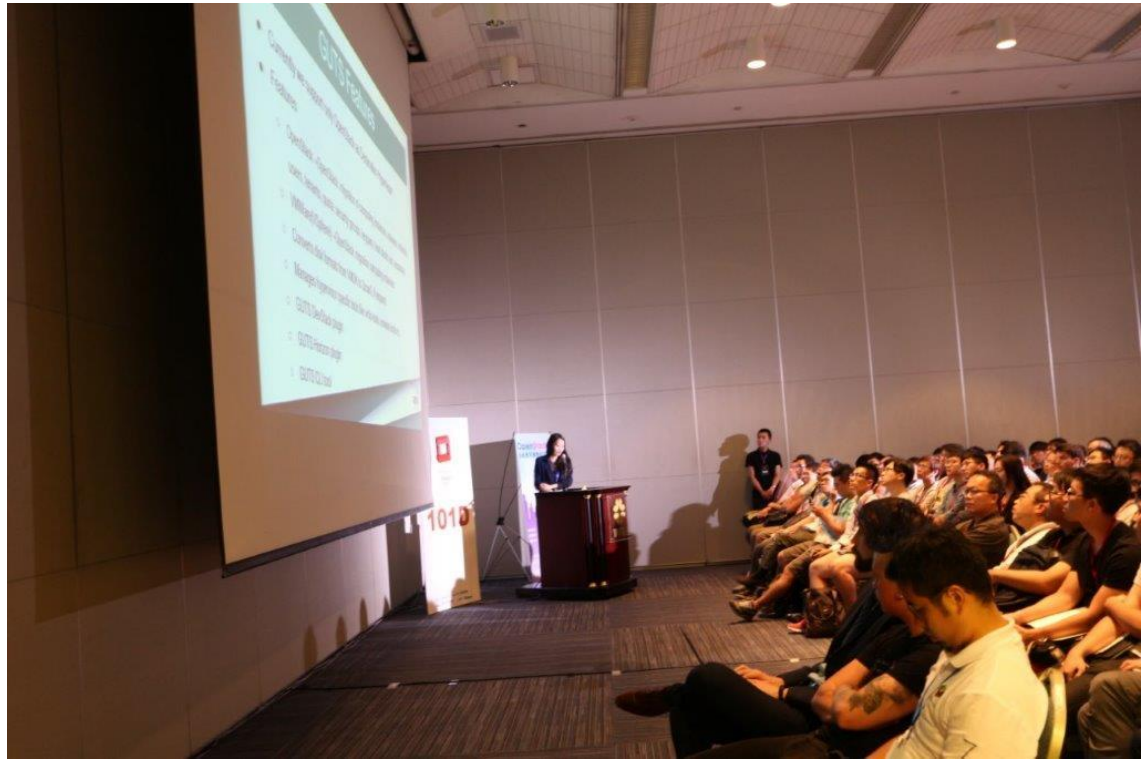
OpenStack International Technology Application Seminar Course 101D