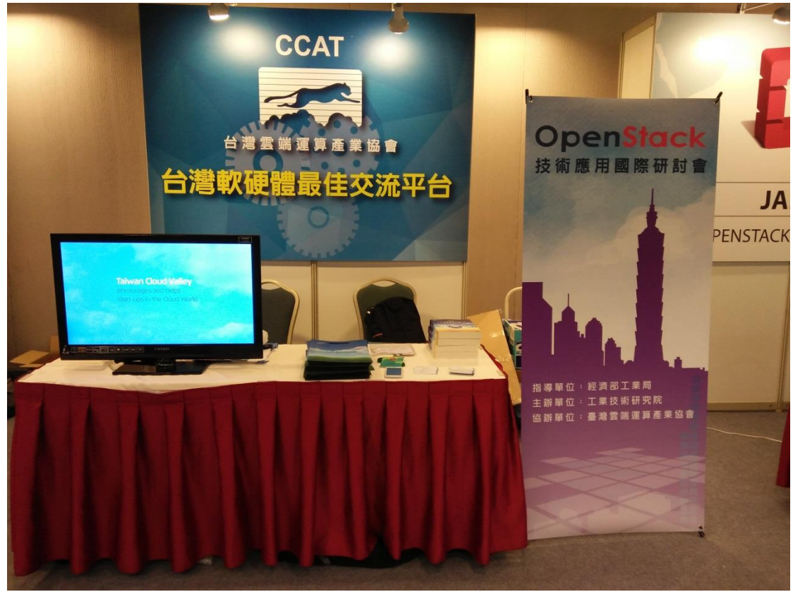
CCAT Exhibition Booth