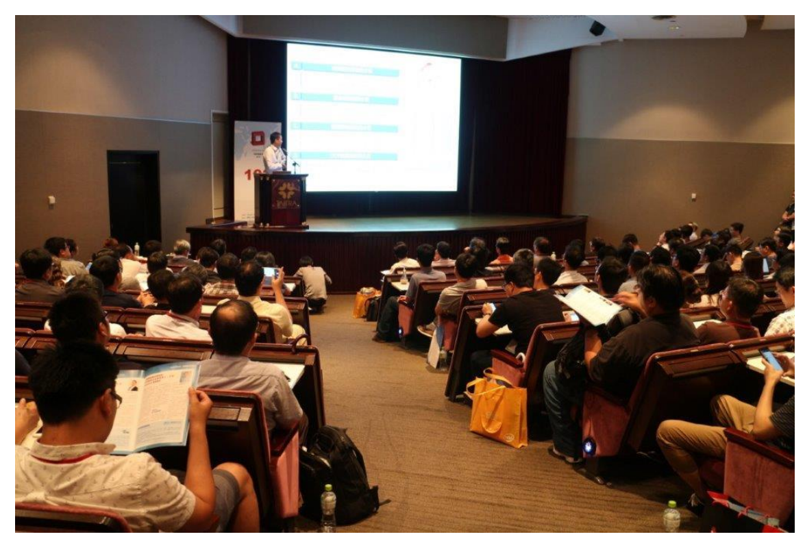
OpenStack T International Technology Application Seminar Course 102