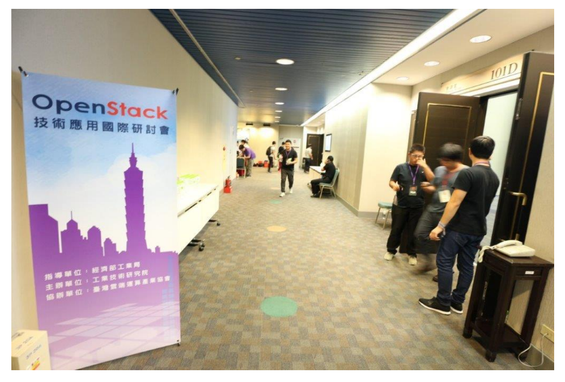
OpenStack International Technology Application Seminar Course 101D