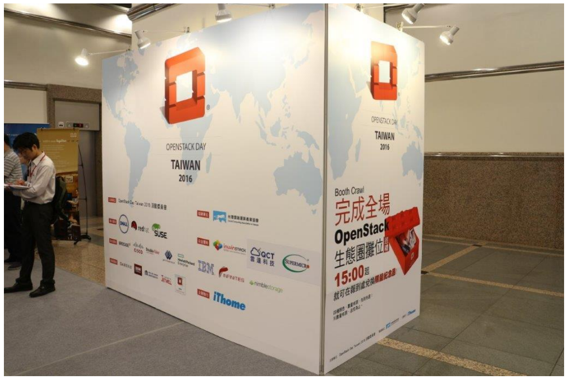
Main visual of event